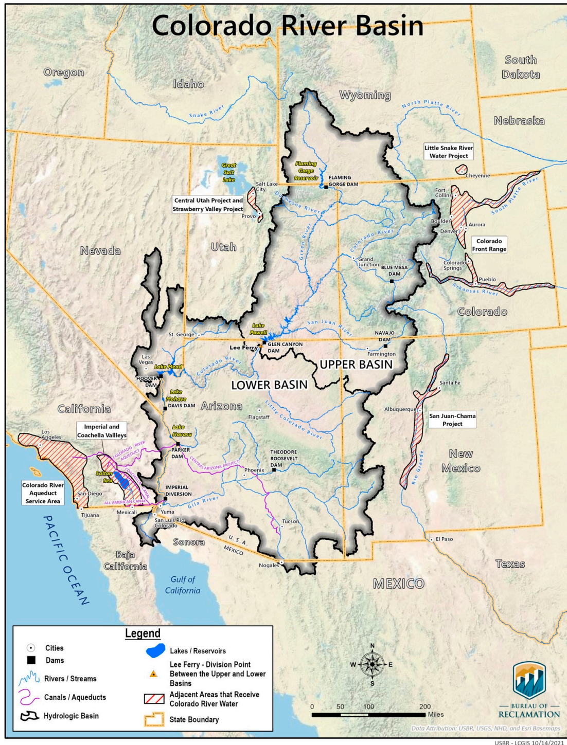
Figure 1. Colorado River Basin. U.S. Bureau of Reclamation.

water for 5 million acres (2 million hectares) of irrigated farmland in nine states across two countries, a centerpiece of economy and culture across a vast reach of rural western North America [20,21].