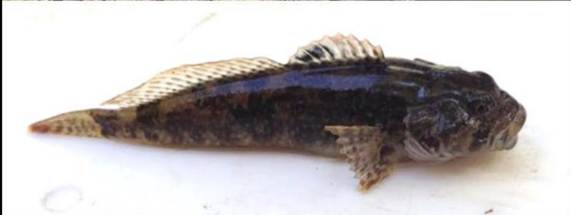
PLATE 2. Prickly sculpin Cottus aper and its habitat in the North Fork of Cache Creek