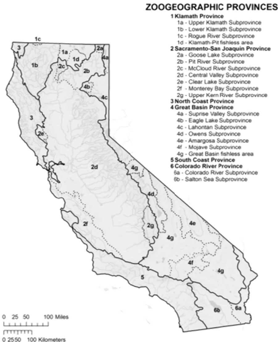
FIGURE 2. Zoogeographic provinces in California (from Moyle 2002)